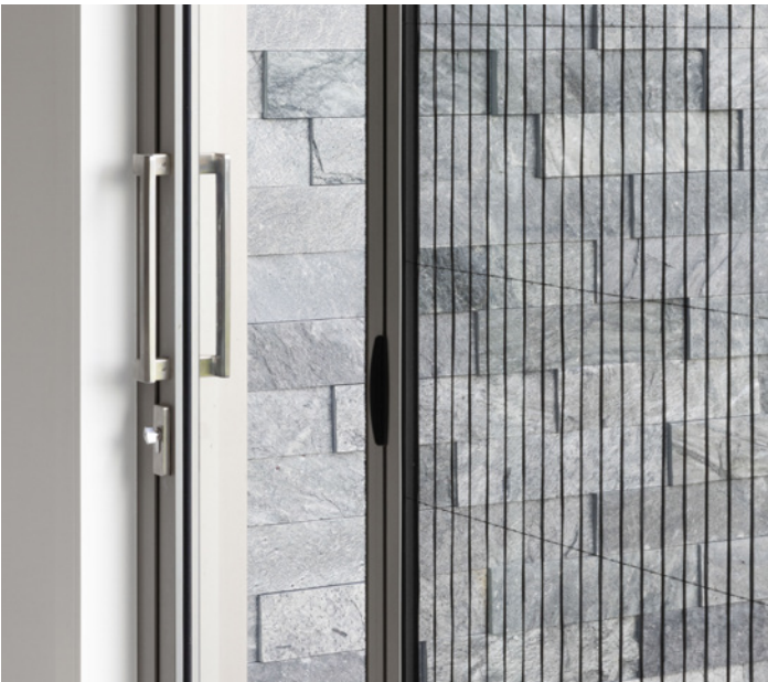
Doors by Watts Glass with 612 screen and Verta furniture