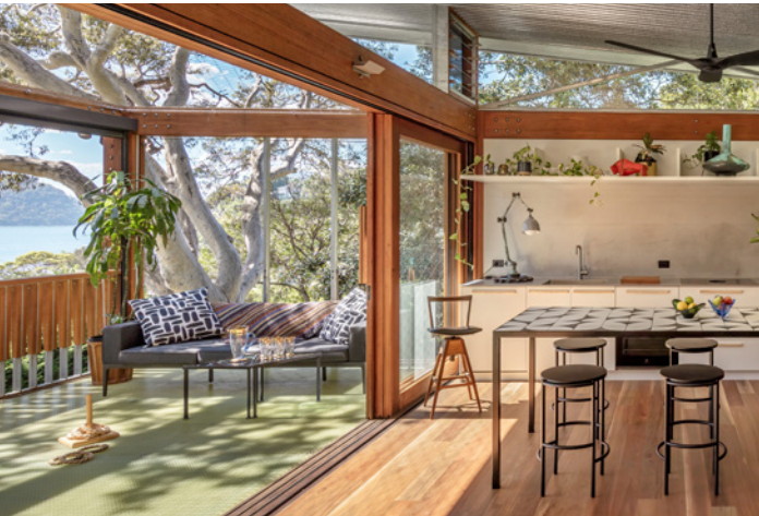
Doors by Windoor Joinery

Both bottom rolling systems feature self levelling, adjustable double bogies with easy side access for in situ adjustment. This design accommodates timber seals and allows rollers to be housed in the rail of the panel, retaining maximum strength in the corner joint. Timberoll 100 supports up to 100kg with quiet nylon rollers and steel case and bearings, ideal for internal and external, non-coastal applications. Timberoll 200, made entirely from stainless steel, offers a 200kg capacity and superior corrosion resistance for coastal environments.