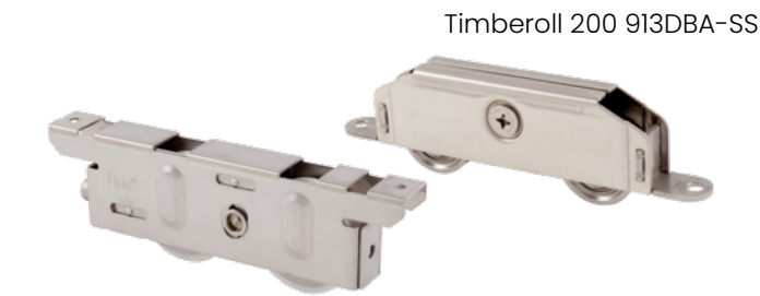
Timberoll 300N 913DBA-300N

Timberoll 300N features an adjustable double bogie with acetal tyres and precision bearings for smooth, quiet operation in a durable, stainless steel body designed to fit both aluminium and timber frames. It offers end feed adjustment and supports multiple panels on single or parallel rails, enabling flexible large openings.